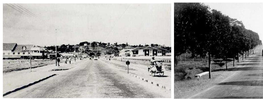
Figure 5. Oei Tiong Ham weg now Jalan Pahlawan in 1972

Karsten also described a plan for housing arrangements in the Candi Baru area [14], which has the characteristics of having low density, beautiful green trees along with roads that provide access to housing.