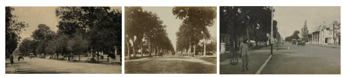
Figure 4. Thomas Karsten's Urban Planning by Exploring the Environment Source: Bodjongsche weg. Semarang 1895 (KITLV Image Code 1405041).

Source: Semarang Maps 1816 PU Cipta Kary 1993/1994, COLLECTIE TROPENMUSEUM Bodjongschen weg te Semarang, TMnr 10014750, 1900 – 1924