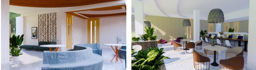
Figure 5. Communal Space Indoor and Cafeteria

Communal space is designed as much as possible and requires a large enough space because it will be used as a space for interaction and socialization of visitors. In the communal space, a variety of furniture will be used to support and become an attraction for users/visitors.