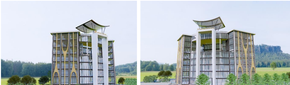
Figure 7. Facade Buildings