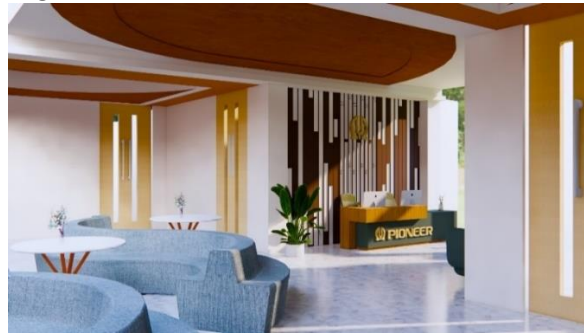
Figure 3. Access to Building (Lobby)

Building Access is the achievement of the circulation of visitors or building users to various spaces without interfering with the activities of other users. In each room, an information board will be given to make it easier for visitors to access the space provided.