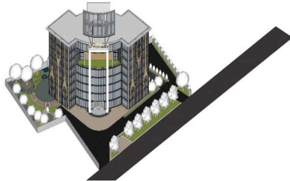
Figure 2. Shelter

Building Access is the achievement of the circulation of visitors or building users to various spaces without interfering with the activities of other users. In each room, an information board will be given to make it easier for visitors to access the space provided.