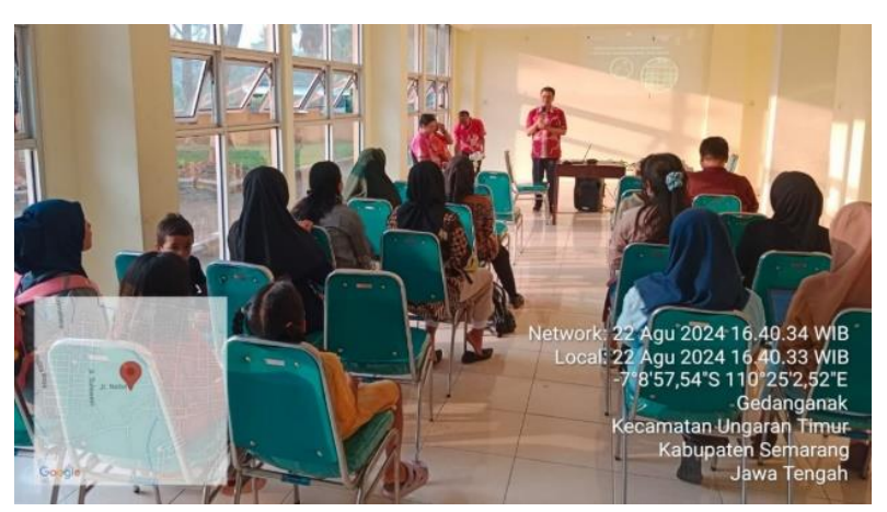
Figure 6. E-transaction socialization meeting in public flat Ungaran