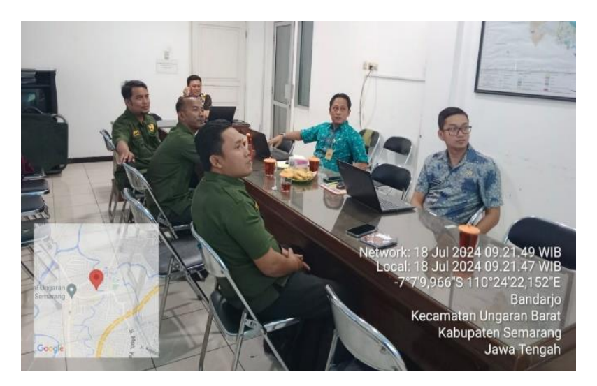
Figure 3 . Technical training and capacity building for personnel of the e-transaction for public flats rent (August 18, 2024)

From the result of the identification above, this research found the importance of adequate ICT infrastructure (hardware and software), and human resources (staff) with competencies related to the e-government project. In this project, there are still gaps in ICT hardware infrastructure availability particularly laptops and internet networks. Meanwhile, limited ICT competencies have been solved by technical training and capacity building for the preparation and operation of the e-transaction for public flat rentals.