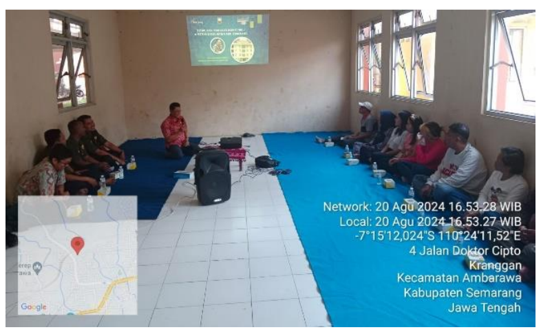
Figure 4. E-transaction socialization meeting in public flat Ambarawa

Meanwhile, the assessment or evaluation of the sub-factors in this value factor can also be seen in Table 3.