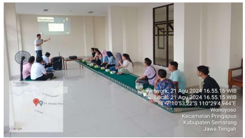
Figure 5. E-transaction socialization meeting in public flat Pringapus