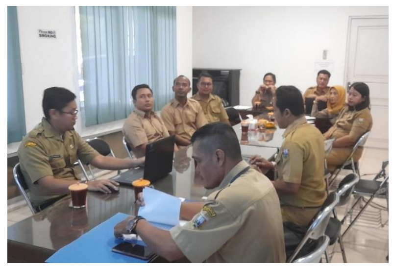
Figure 1. Coordination meeting for the preparation of e-transaction (15 July 2024)