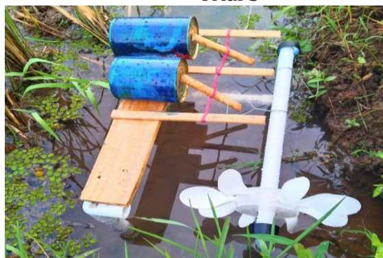
Figure 6: Trial 3

In the final test, the examiner tested the rat repellent device. Based on the data obtained, the tool can work well until the rice harvest is complete. After recording the rice harvest data, it was discovered that there had been an increase in yields of 20 kilograms of rice on 700 square meters of rice fields. Initially, the harvest before the rat repellent was installed produced 250 kilograms. After rat repellent devices were installed around the rice fields, the harvest increased to 270 kilograms. The score obtained by the examiners was 96.8%. So this research is relevant to previous research which stated that mice can be driven away by using noise with a frequency of 40Hz to 60Hz. Thus, a STEAM-based mechanical rat repellent device powered by a water turbine is declared to be very suitable for application in rice fields.