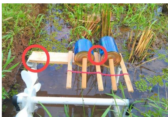
Figure 4: Trial 1

After making improvements to the product, a second trial was carried out again on five media validators. In the second trial, the score was 93.6%. During testing, there was an obstacle, namely the rotating wire was entangled in the grass around the water flow so it could not rotate. The examiner provided input to place the tool in a more spacious place to avoid a similar thing.