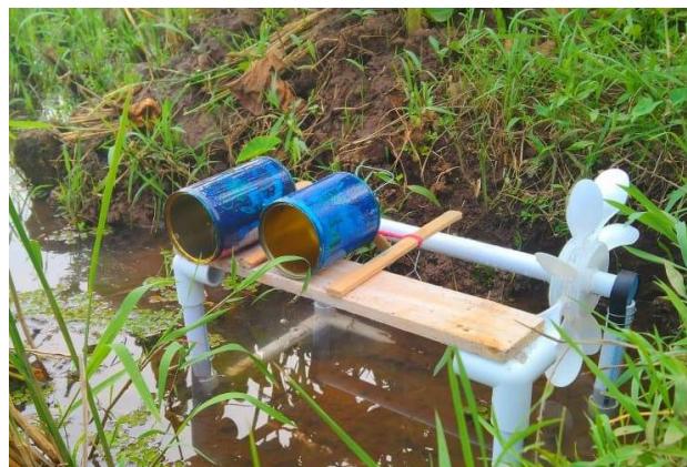
Figure 2. STEAM Based Water Turbine Powered Mechanical Rat Repellent Device

A STEAM-based water turbine powered mechanical rat repellent device is based on the basic concepts of Science, Technology, Engineering, Art, and Mathematics. One of the aspects contained in rat repellent devices is science. The scientific aspect is the aspect where the product made involves natural resources, namely by relying on water energy as mechanical power to drive the propeller. Utilization of water resources was chosen as the most effective solution because researchers consider agricultural products have little benefit. Water as a renewable energy source will be more effective and efficient because farmers do not need to think about product operational costs. Apart from that, the maintenance costs incurred are relatively small because they use used materials. Thus, it is hoped that this STEAM-based water turbine-powered mechanical rat repellent device will not burden farmers.