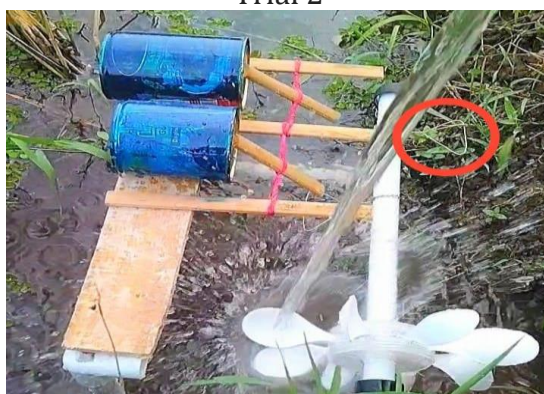
Figure 5: Trial 2

In subsequent tests, the tool's performance worked well. However, testers still have not found evidence that the device can repel mice. The value obtained in the third test was 93.6%. Testers recommend installing rat repellent devices within 1 week or until the rice harvest is finished so that they can compare the effectiveness of the rat repellent devices.